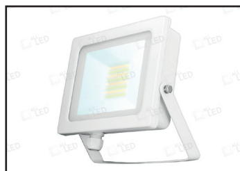
Polar White* AFL020/CCT/WH