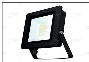
Carbon Black* AFL020/CCT/BK