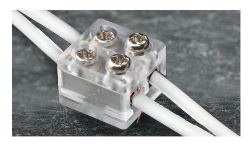
Cable Coupler Cable to Cable