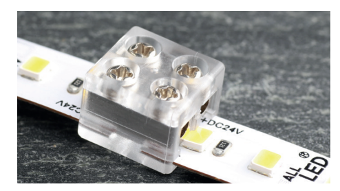
LED Strip Coupler Strip to Strip