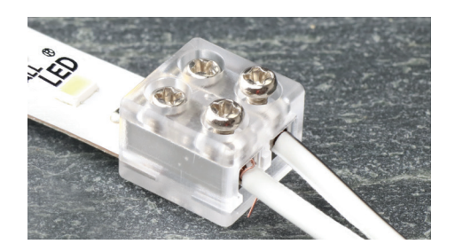
Live End Strip to Cable