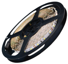
5M LED Strip