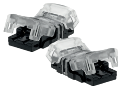
2x Quick Connectors Included