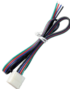
4x Quick Connectors Included