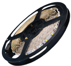
5M LED Strip